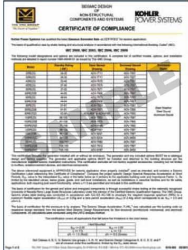
Figure 3. Seismic Certificate of Compliance

isolator. There is no need to invest extra expense on additional seismic isolators for mounting.