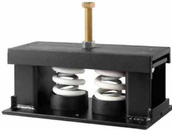
Figure 1. This seismically certified coil spring isolator is typically mounted between the generator skid and ground.